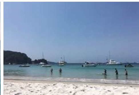
Peachgrove Bay – Mercury Island