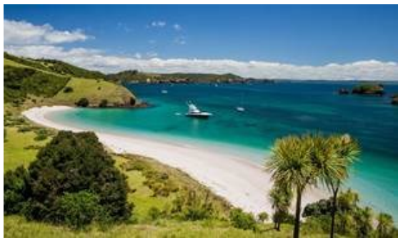
Bay of Islands

Experience and enjoy a personal view of the region - sightseeing, walking, hiking, swimming, visit wineries, or try your hand at fishing. Ata Rangi's leisure equipment includes paddleboards, surfboards, wakeboards, wake skate, sea biscuit and snorkelling gear, and fold up bikes. Water sports can be enjoyed from Ata Rangi's tender. It is very