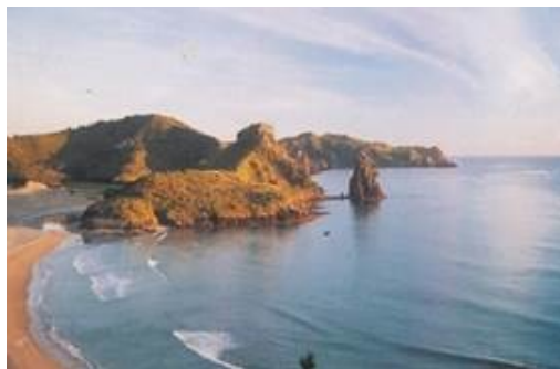
Great Barrier Island