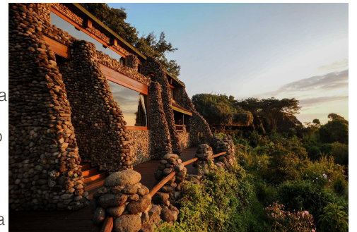
Ngorongoro Serena Lodge, Tanzania

Accommodations include intimate lodges with stunning views in Arusha and Ngorongoro, a mobile tented camp in the Serengeti for optimal wildlife viewing, a tented camp in Masai Mara selected for comfort and luxury in the bush. The Great migration is natural phenomena; experience it in a completely unique way with Tauck and BBC Earth.