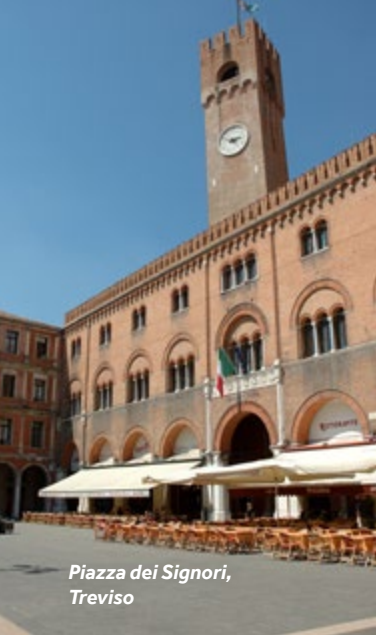
Piazza dei Signori, Treviso