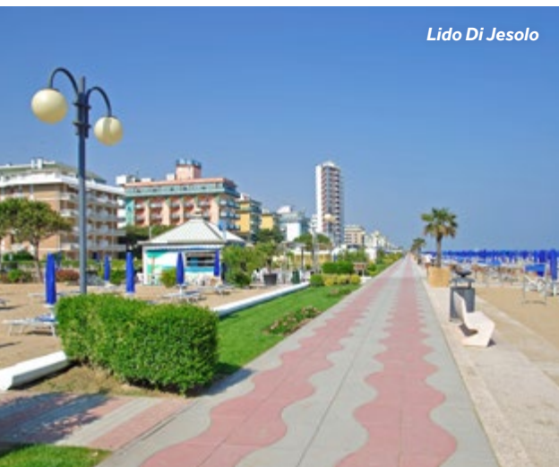
Lido Di Jesolo

Moorings: Only available at Darsena dell’Orologio (+39 0421 84207) – call ahead so a staff member in a dinghy can help you moor.