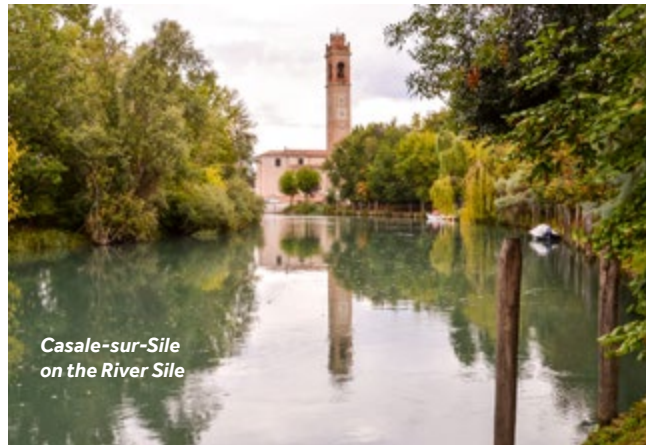
Casale-sur-Sile on the River Sile

Moorings: There is a cement jetty beneath the church tower.