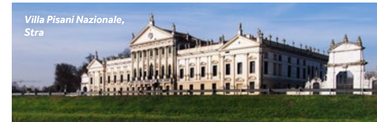
Villa Pisani Nazionale, Stra

Moorings: There are free moorings near the town square.