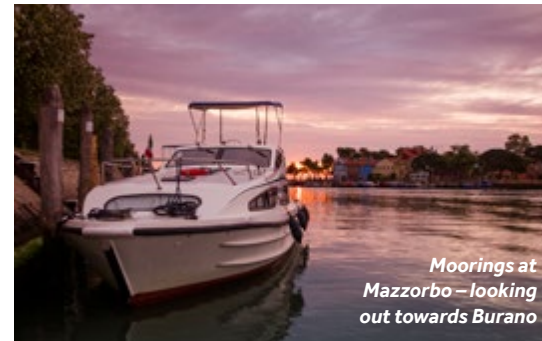
Moorings at Mazzorbo – looking out towards Burano

The most important archaeological site in the Lagoon, Torcello dates back to the Roman Empire. Torcello's main attraction is the Basilica di Maria Assunta, founded in 639, is Venice's oldest cathedral, and one of the most beautiful, with intricate mosaics decorating its floor and walls. Its bell towers afford stunning views across the lagoon, and you can also listen to an audio-guide to learn more about the church's history. The adjacent Museum has Roman and Byzantine collections on display. A stroll to the other end of the island will take you past the famous Cipriani restaurant, once frequented by Ernest Hemingway, and the so-called "Devil's Bridge", said to be haunted by the Devil.