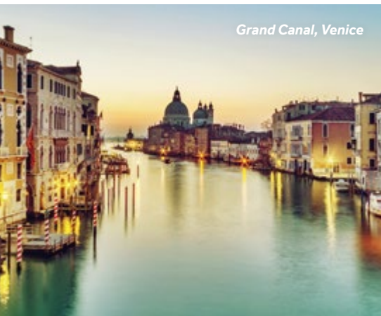
Grand Canal, Venice

Piazza San Marco is always teeming with tourists, keen to admire the Byzantine Basilica with its luminous gold mosaics and intricate detail. Take the elevator to the top of the 98 metre high Campanile, once used by approaching ships as a beacon to guide them home, for a breath-taking view of the city and lagoon. The gothic Doge's Palace next door is now a museum housing paintings dating back to the 15th century. Buy your ticket in advance to avoid long queues. Stop outside the "Porta della Carta", the palace's main entrance and take in the incredible sculptures which adorn it.