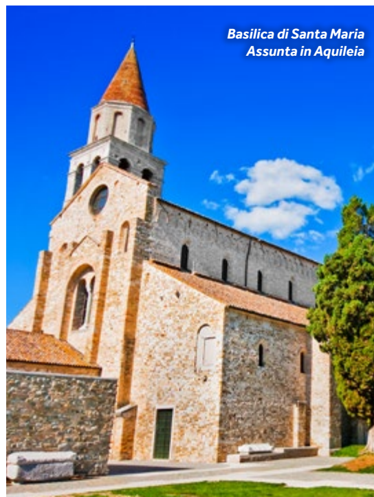
Basilica di Santa Maria Assunta in Aquileia

Moorings: About 2km downstream of the town centre is the Marina di Aquileia. Do not travel beyond the fork in the Natissa River - this is the last spot wide enough to turn your boat around.