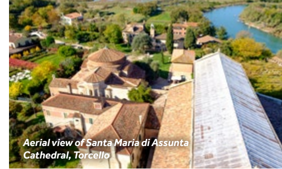
Aerial view of Santa Maria di Assunta Cathedral, Torcello

Moorings: Moor at Mazzorbo and cross the footbridge.