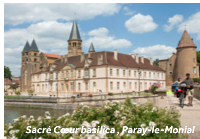
Sacré Cœur basilica, Paray-le-Monial