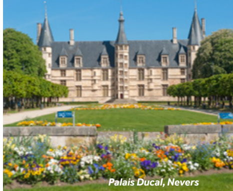
Palais Ducal, Nevers

Amenities: Bakery, 1.5 km from the mooring.