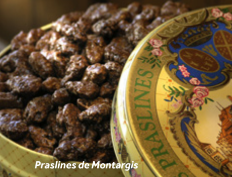
Praslines de Montargis