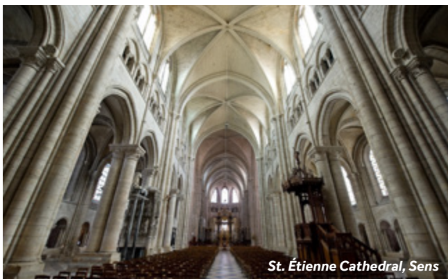
St. Étienne Cathedral, Sens