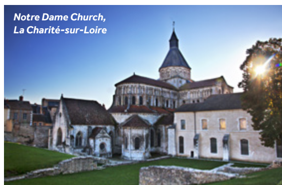
Notre Dame Church, La Charité-sur-Loire

Market: Sat (am) in La Charité-sur-Loire.