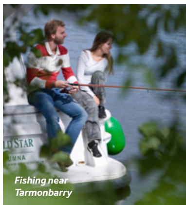
Fishing near Tarmonbarry

Amenities: You'll find a supermarket, pharmacy, butcher and bakery here.