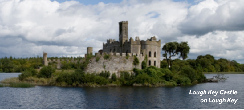
Lough Key Castle on Lough Key