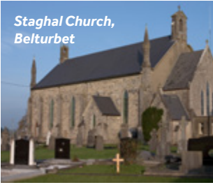
Staghal Church, Belturbet