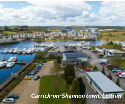
Carrick-on-Shannon town, Leitrim

Recommended restaurant: Take a short taxi drive to the Historical town of Boyle with lots of Bars & Restaurant. Amenities: There's a few small supermarkets here, and a pharmacy.