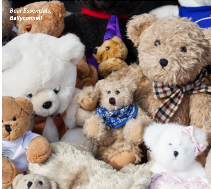
Bear Essentials, Ballyconnell

Amenities: You'll find a supermarket, butchers and pharmacy here.