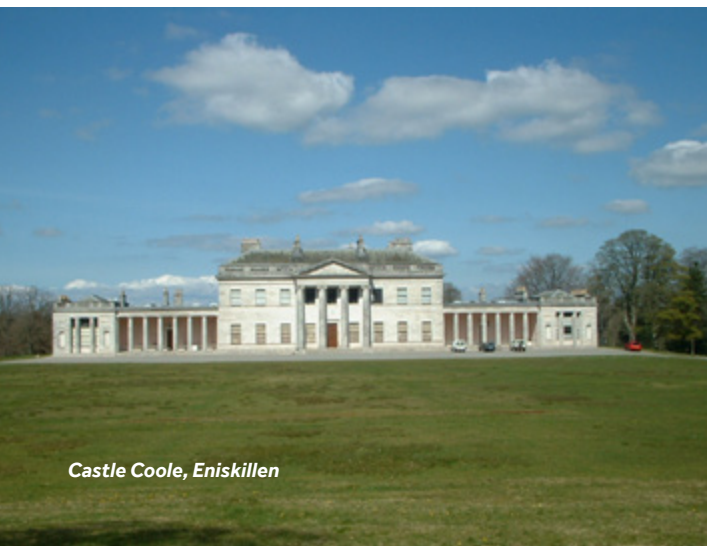
Castle Coole, Enniskillen