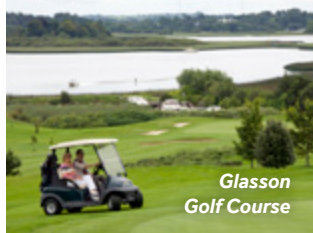
Glasson Golf Course

On the south-eastern shores of Lough Ree is Glasson Golf Club, boasting superb lakeside scenery and tour-quality fairways and greens. And nearby, in Hodson Bay, you'll find Athlone Golf Club which has been chosen many times by the Golfing Union of Ireland as a venue for competitions at all levels.