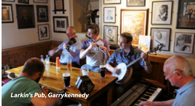
Larkin's Pub, Garrykennedy