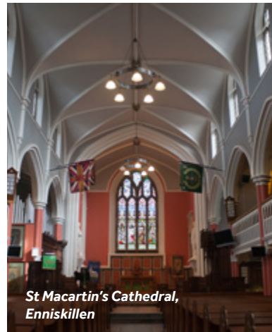
St Macartin's Cathedral, Enniskillen

Amenities: You'll find everything you need here – shops, supermarkets, pharmacies, bakeries, butchers, cafés and restaurants.