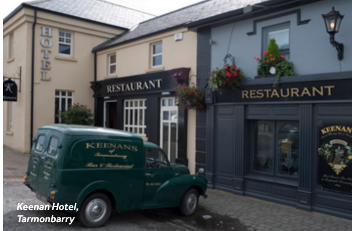
Keenan Hotel, Tarmonbarry

Cox's Steakhouse, located a short distance from Dromod Harbour on Harbour Road.