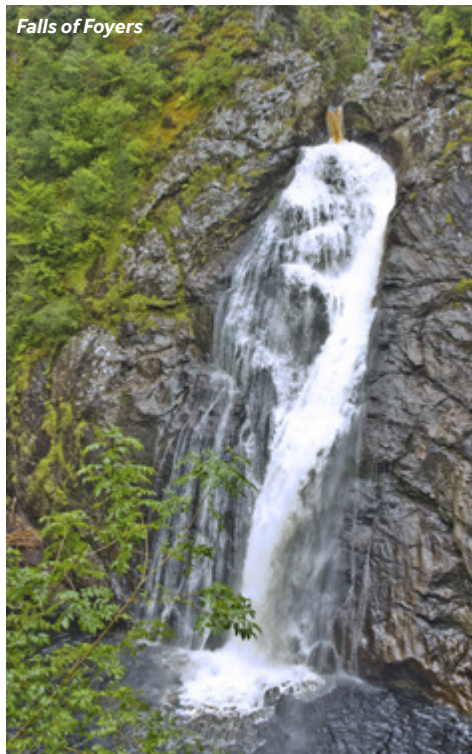
Falls of Foyers

Amenities: There is a small grocery store, tearoom and post office near the Craigdarroch House Hotel.