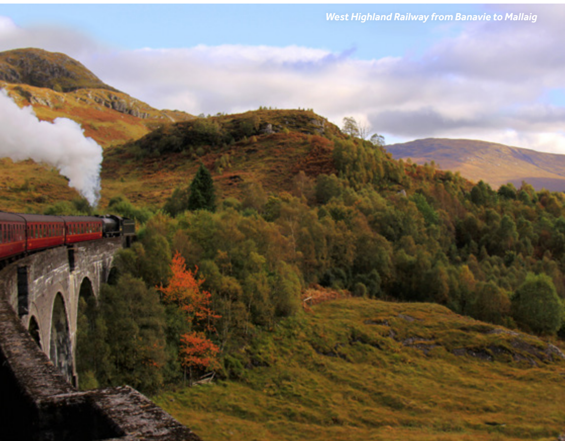
West Highland Railway from Banavie to Mallaig