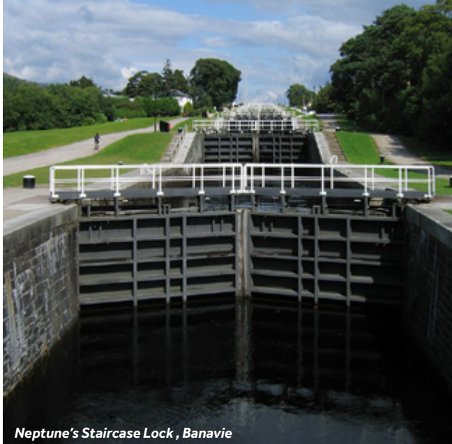
Neptune's Staircase Lock , Banavie

Amenities: There is a minimarket, shops, restaurants, cafés, butcher and pharmacy.