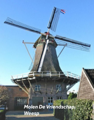
Molen De Vriendschap, Weesp