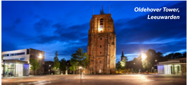
Oldehover Tower, Leeuwarden