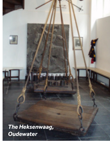
The Heksenwaag, Oudewater

Oudewater is one of the oldest towns of the Netherlands with around 250 protected buildings in the town. While there are a few small boutiques and restaurants, the main attraction here is The Heksenwaag, where witches were tried in the 16th century. They were weighed on the scales and if above a certain weight; they were deemed too heavy to ride a broomstick and therefore must not be a witch. If they passed the weighing they would receive an official certificate. There is now a small museum in the Heksenwaag in honour of this colourful past.