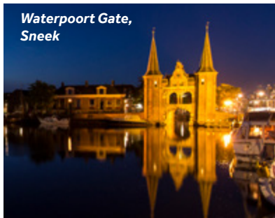
Waterpoort Gate, Sneek

Sneek is Friesland's most famous water sports town. Every year in August, there is a large sailing regatta on the lake and all kinds of activities in the town. A visit to the famous 'Waterpoort', the only of its kind and remaining form the 17th century town walls, should not be missed when you are here. The maritime museum gives you a glimpse into the city's nautical past and also has a beautiful collection of Frisian silver. And for children, the model train museum is also very nice to visit. The town is also known for its regional speciality, Beerenburg, a herb-flavoured gin which used to be a medicine in the past. You can taste and buy beerenburg in the original and authentic Weduwe Joustra shop.