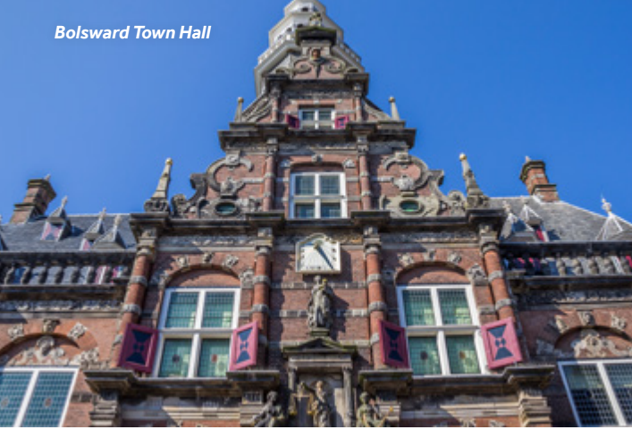
Bolsward Town Hall