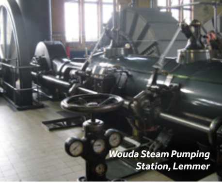
Wouda Steam Pumping Station, Lemmer