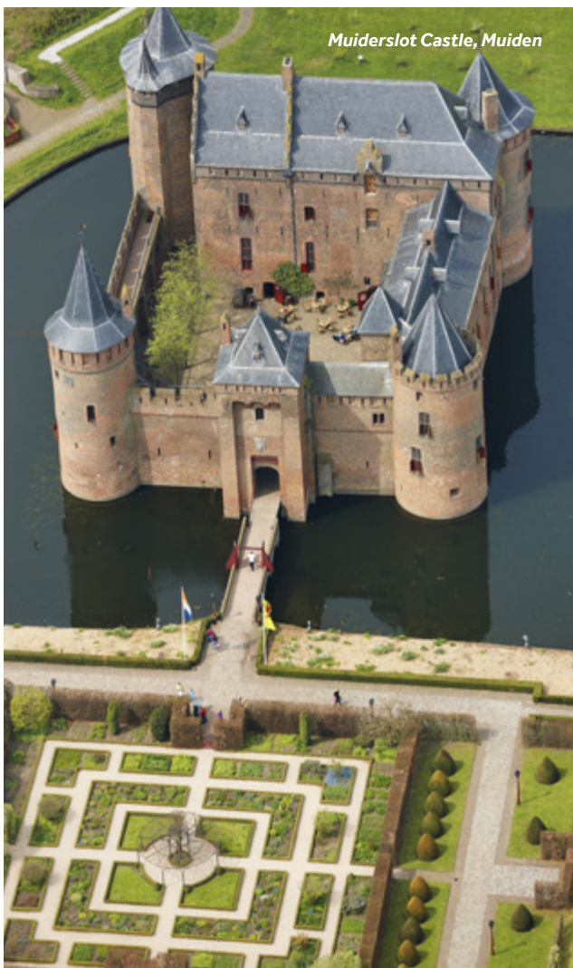
Muiderslot Castle, Muiden