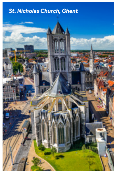
St. Nicholas Church, Ghent

Amenities: All the shops, restaurants and supermarkets you'd expect in a major city