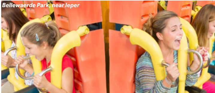
Bellewaerde Park, near Ieper