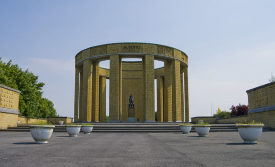
King Albert I Monument, Nieuwpoort