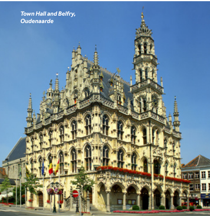
Town Hall and Belfry, Oudenaarde

Amenities: There are a number of supermarkets and restaurants in Deinze