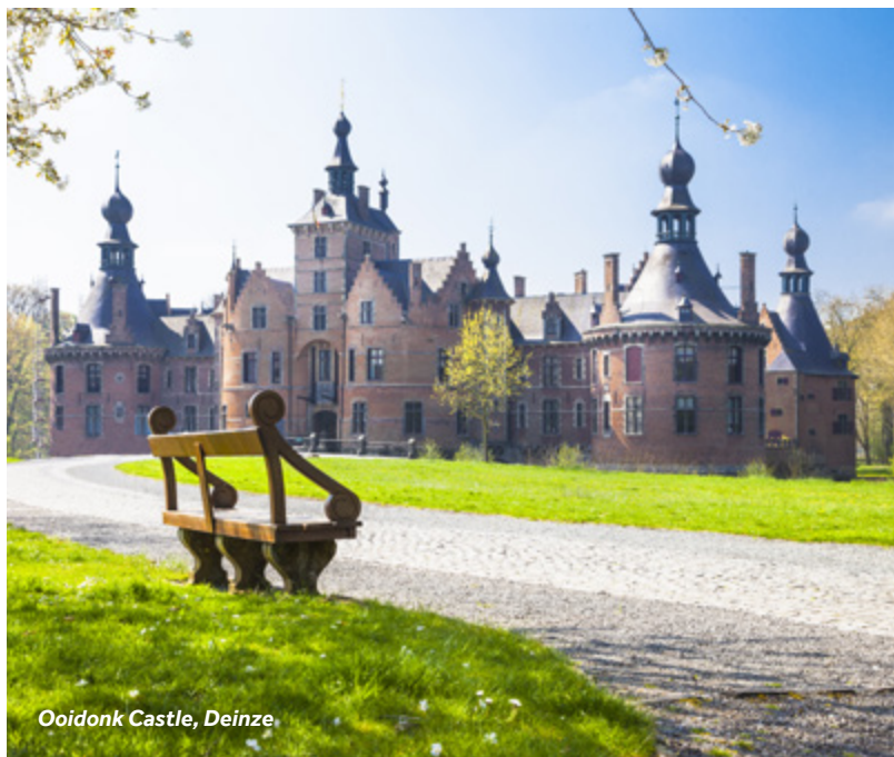
Ooidonk Castle, Deinze

6km to the north east, sits elegant and majestic Ooidonk Castle, one of the most beautiful in Europe. The castle is only open on Sundays and public holidays, but the gardens are open from Tuesday afternoons to Sunday for a tranquil stroll in among the green and watery surroundings.