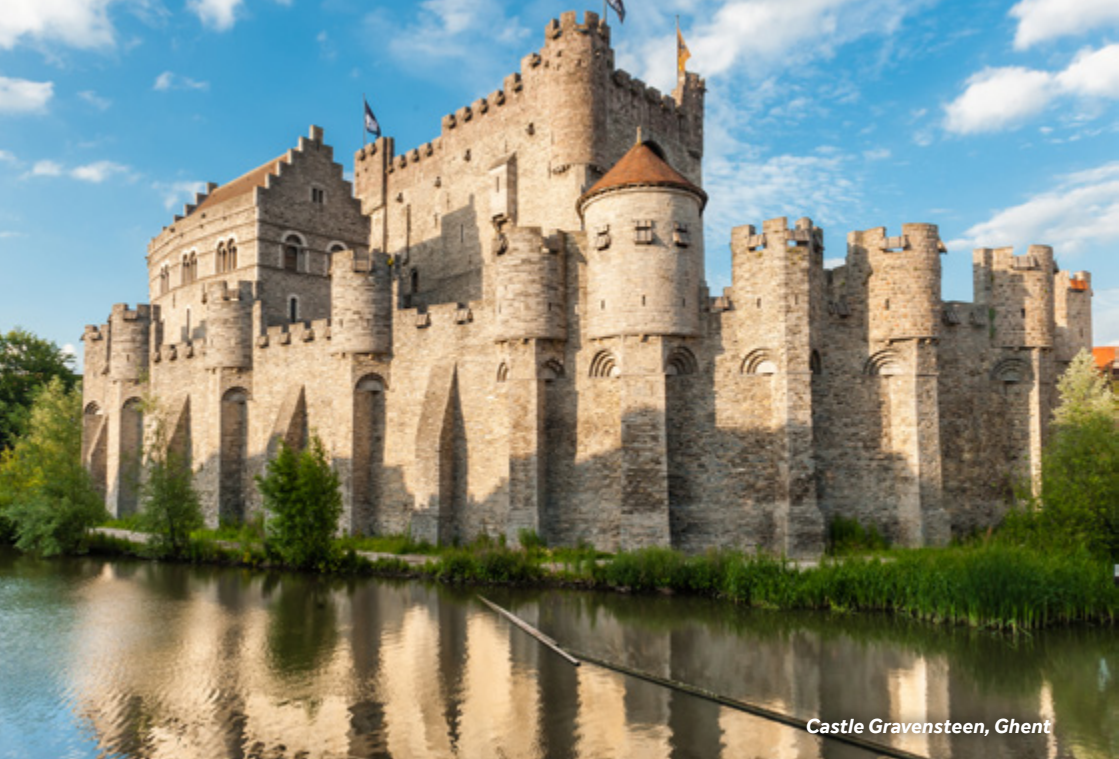
Castle Gravensteen, Ghent