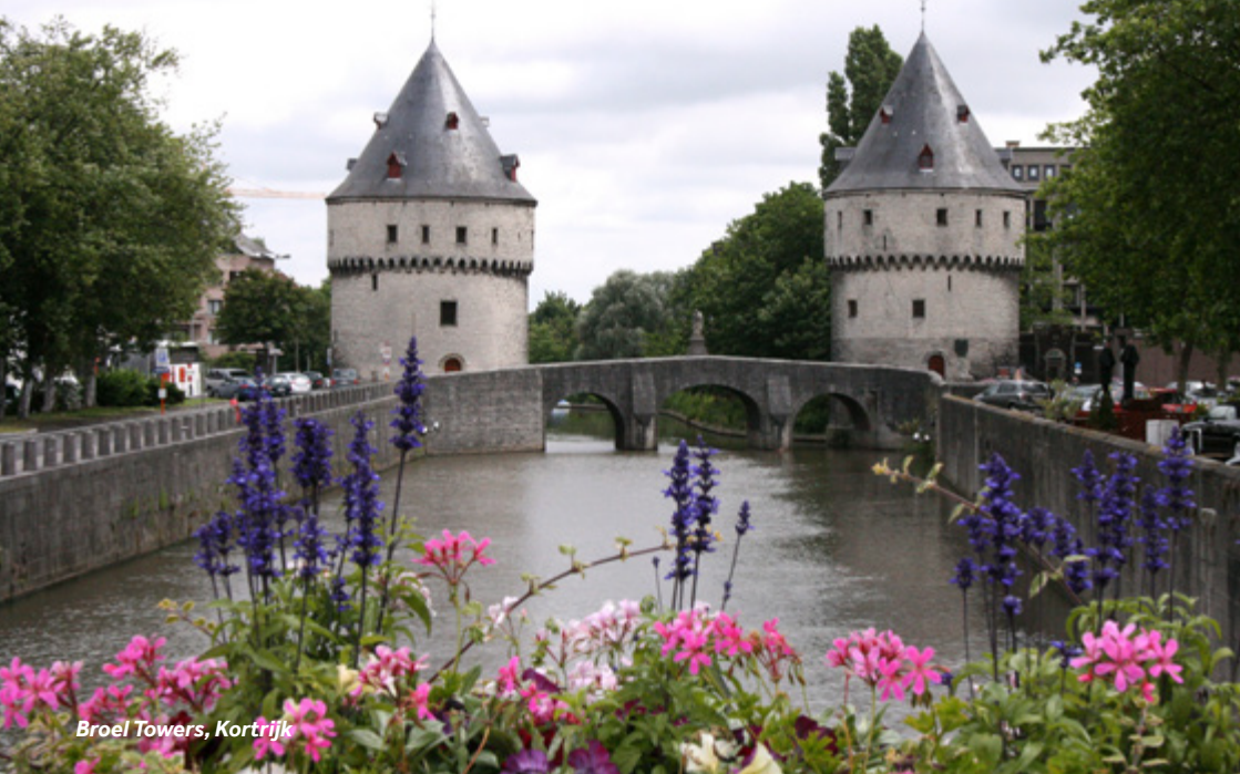
Broel Towers, Kortrijk