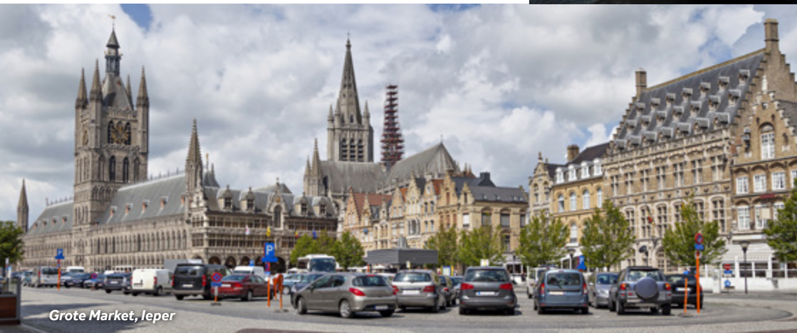
Grote Markt, leper