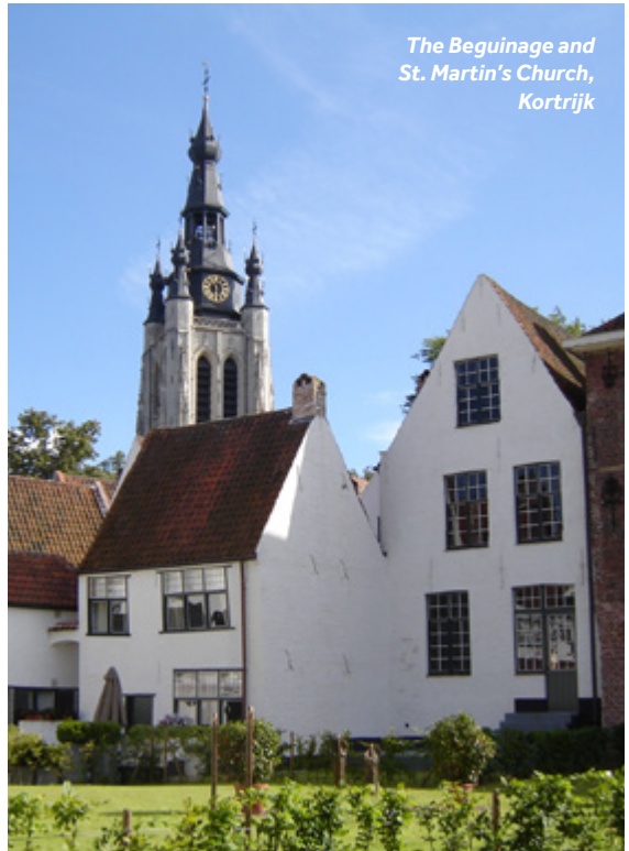
The Beguinage and St. Martin's Church, Kortrijk

Amenities: There are supermarkets and a vast array of shops in the town's large 'K' shopping precinct.