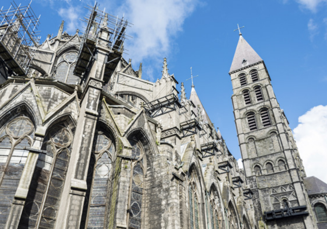
Notre Dame Cathedral, Tournai

Amenities: Plenty of shop and restaurants and a supermarket a short walk south east of the Cathedral.