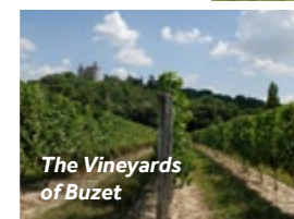
The Vineyards of Buzet