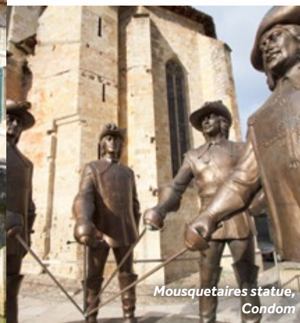
Mousquetaires statue, Condom

Discover the upper city with its majestic St. Pierre cathedral and its gothic cloister. In the cathedral square stands the statue of the Gascony's famous hero, D'Artagnan and his three musketeers. Don't forget to taste the local brandy, Armagnac, while you're here. The Maison Ryst-Dupeyron offers visits of the cellars and tasting of this divine nectar. And if you follow the towpath (1.5km away) from the mooring towards Gauge lock, there's a swimming pool if you fancy a splash.