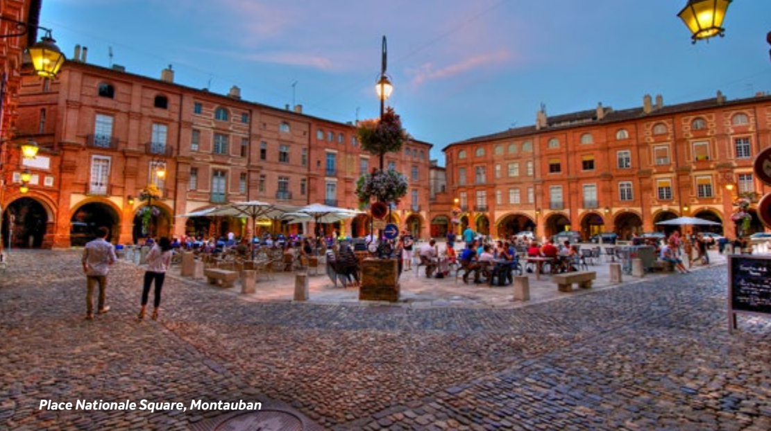
Place Nationale Square, Montauban