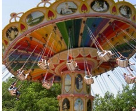
Walibi Attraction Park, Agen