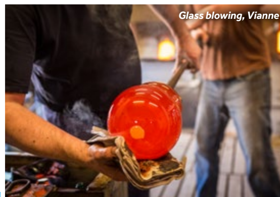
Glass blowing, Vianne

Night market: every Fri evening in summer.