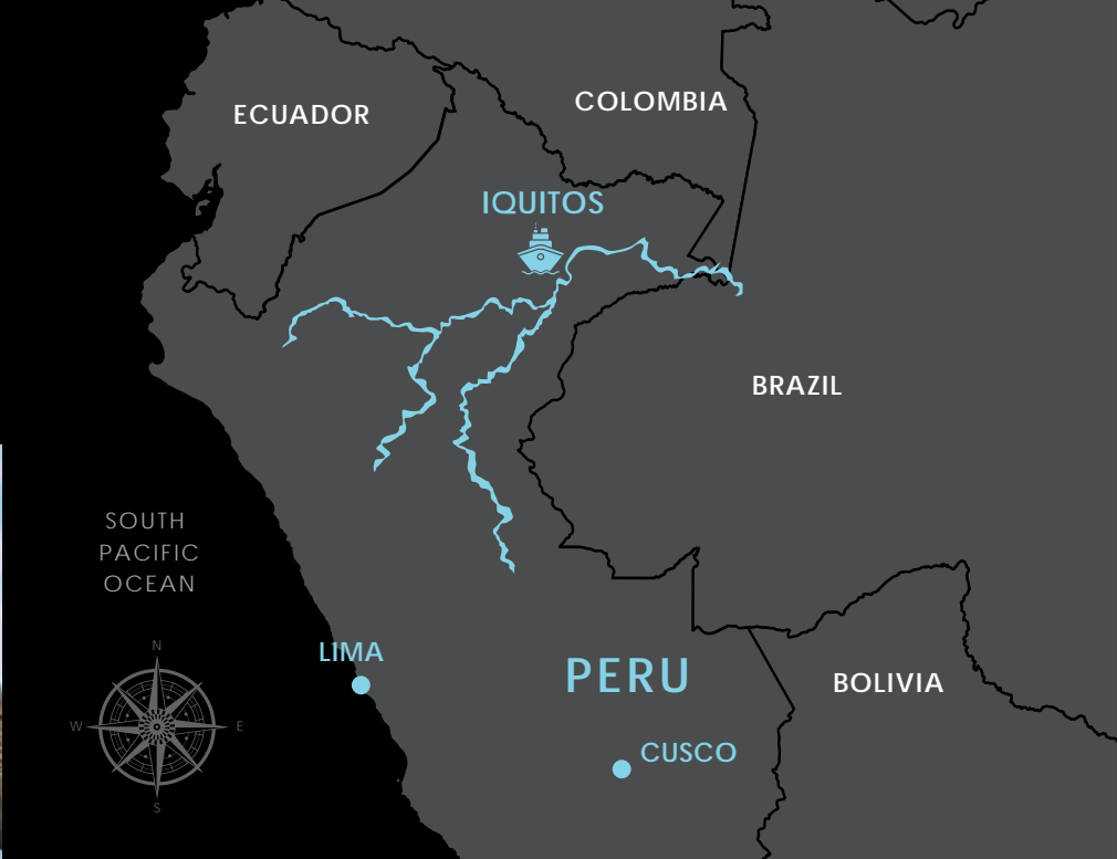
SOUTH PACIFIC OCEAN