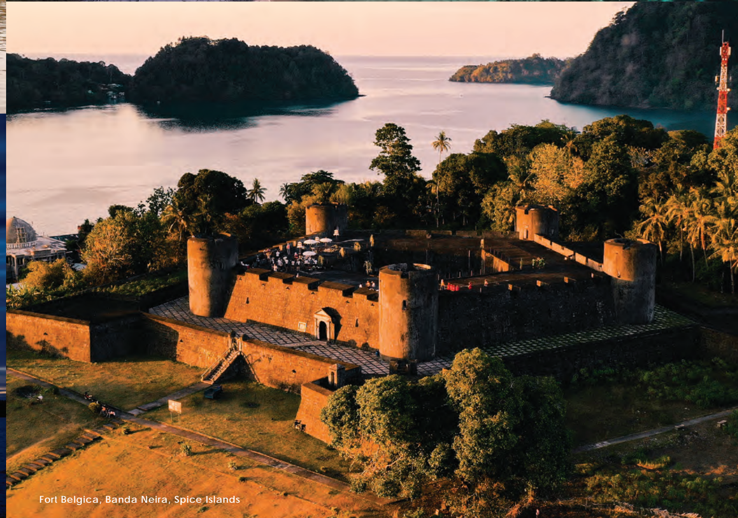
Fort Belgica, Banda Neira, Spice Islands