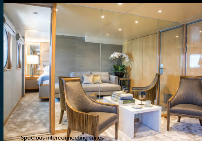
Spacious interconnecting suites