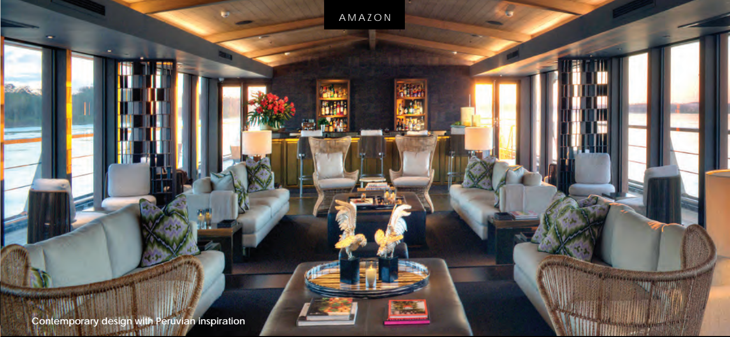
Contemporary design with Peruvian inspiration