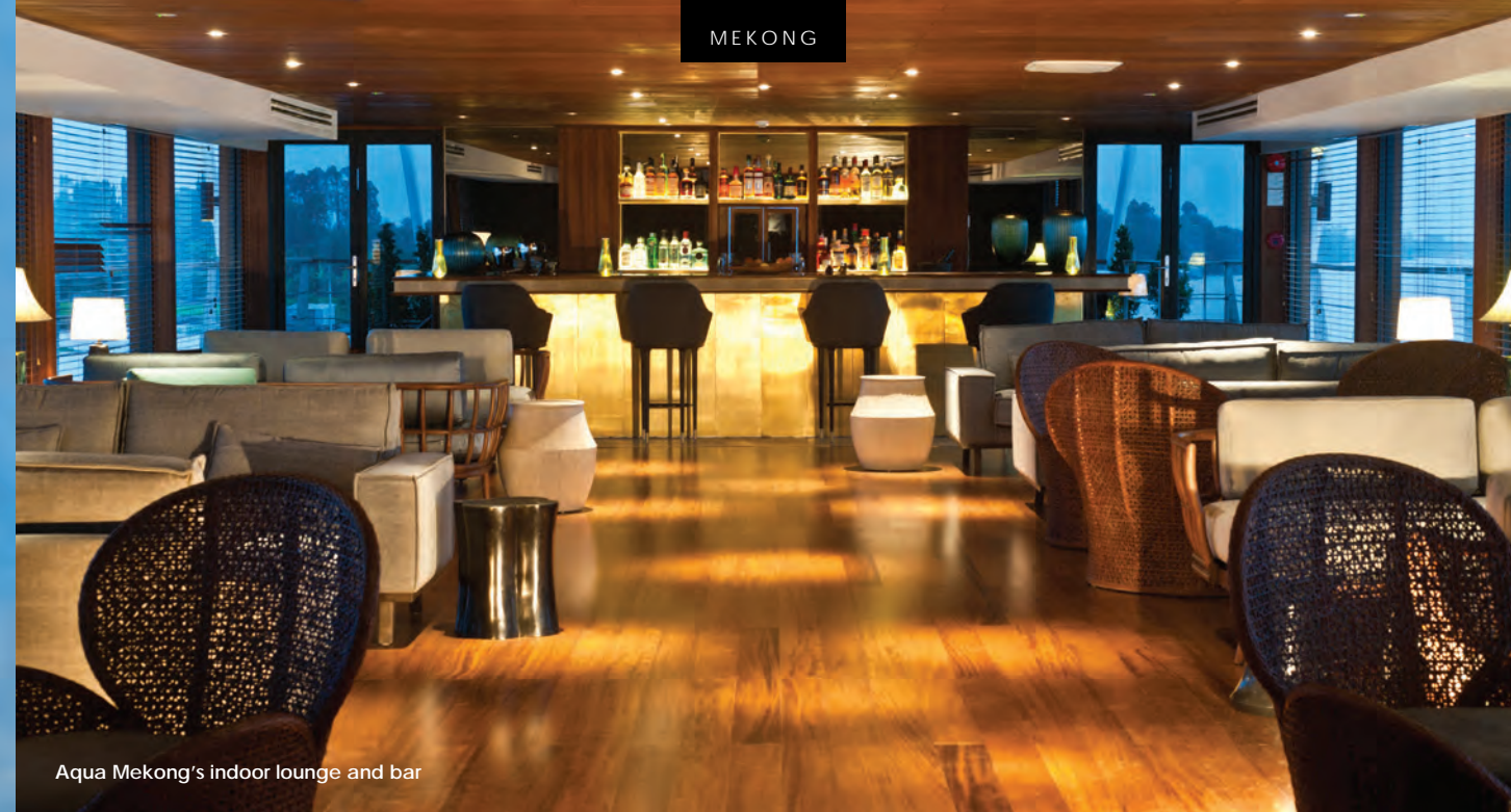
Aqua Mekong's indoor lounge and bar