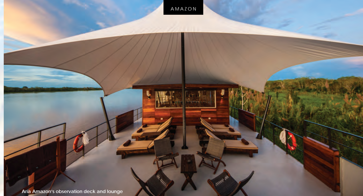
Aria Amazon's observation deck and lounge