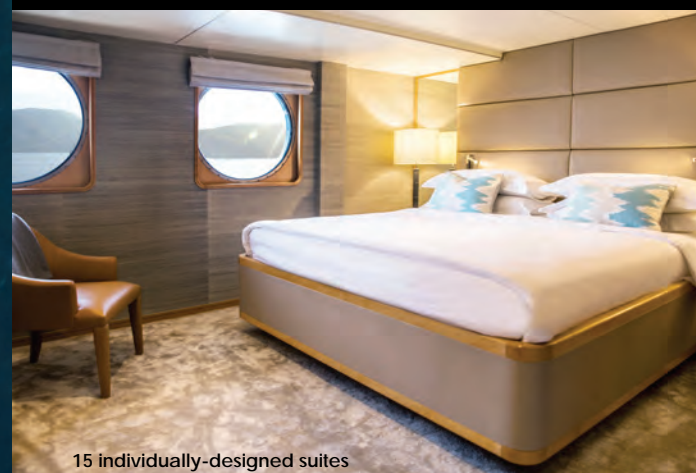
15 individually-designed suites