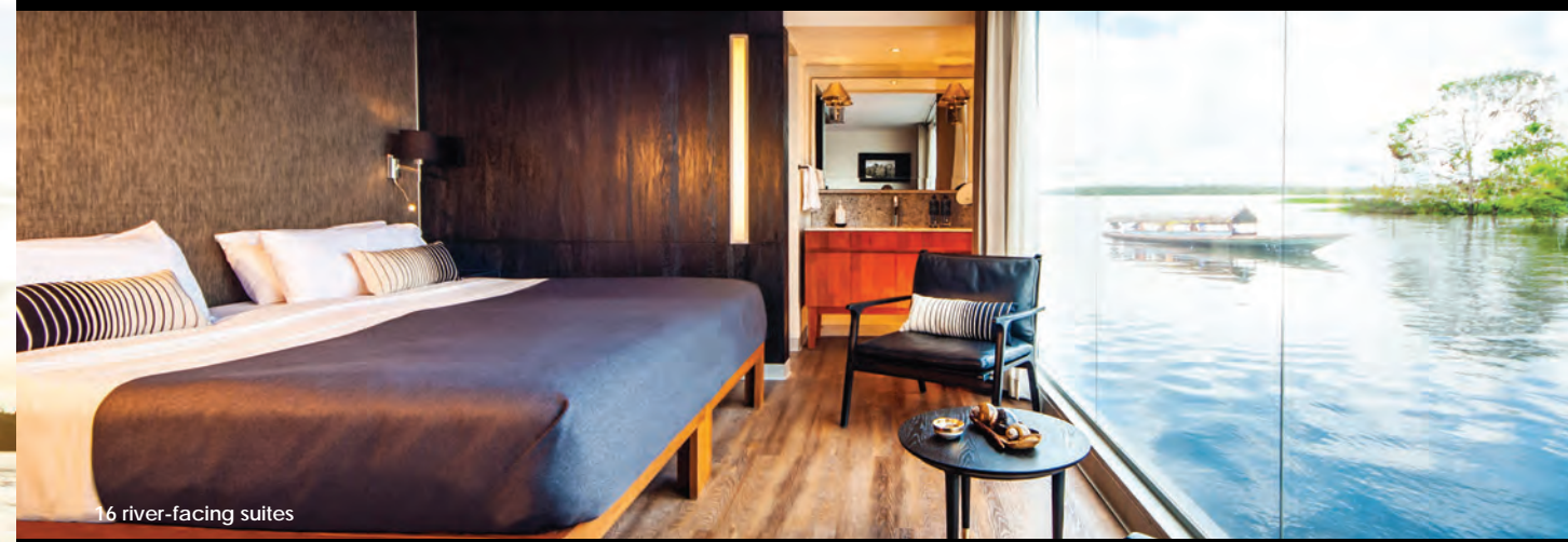
16 river-facing suites