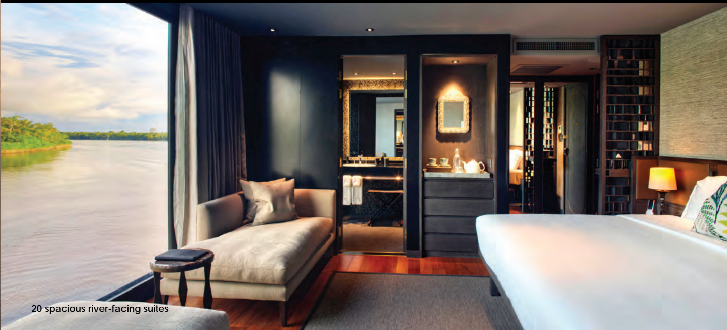
20 spacious river-facing suites