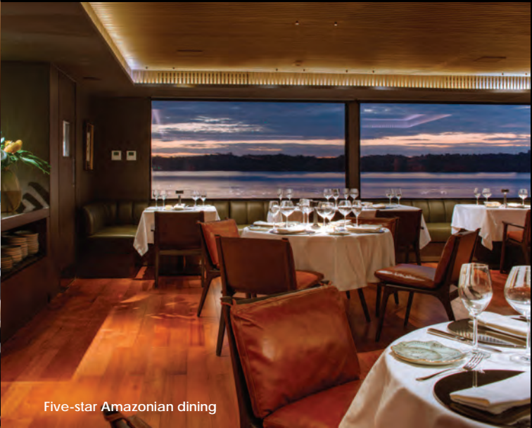
Five-star Amazonian dining