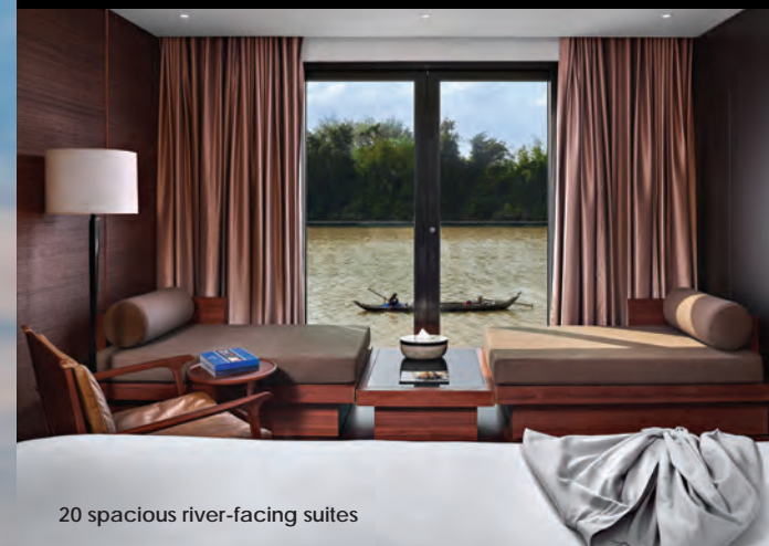
20 spacious river-facing suites