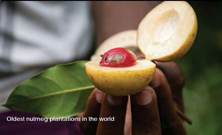
Oldest nutmeg plantations in the world