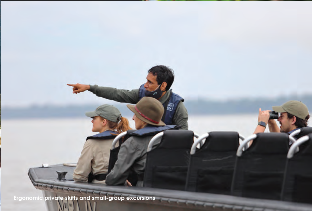
Ergonomic private skiffs and small-group excursions