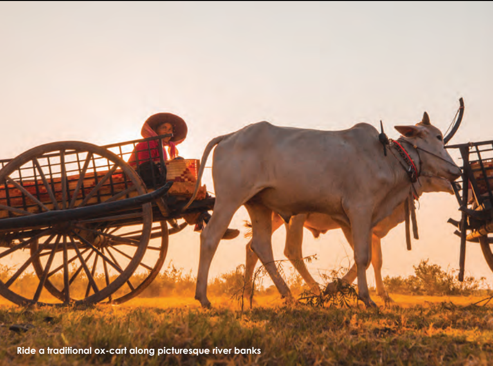
Ride a traditional ox-cart along picturesque river banks