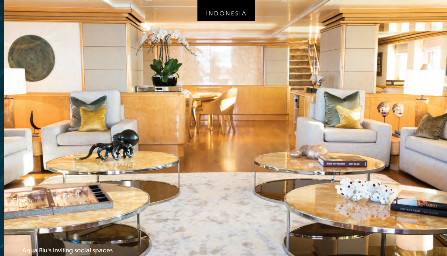
Aqua Blu's inviting social spaces