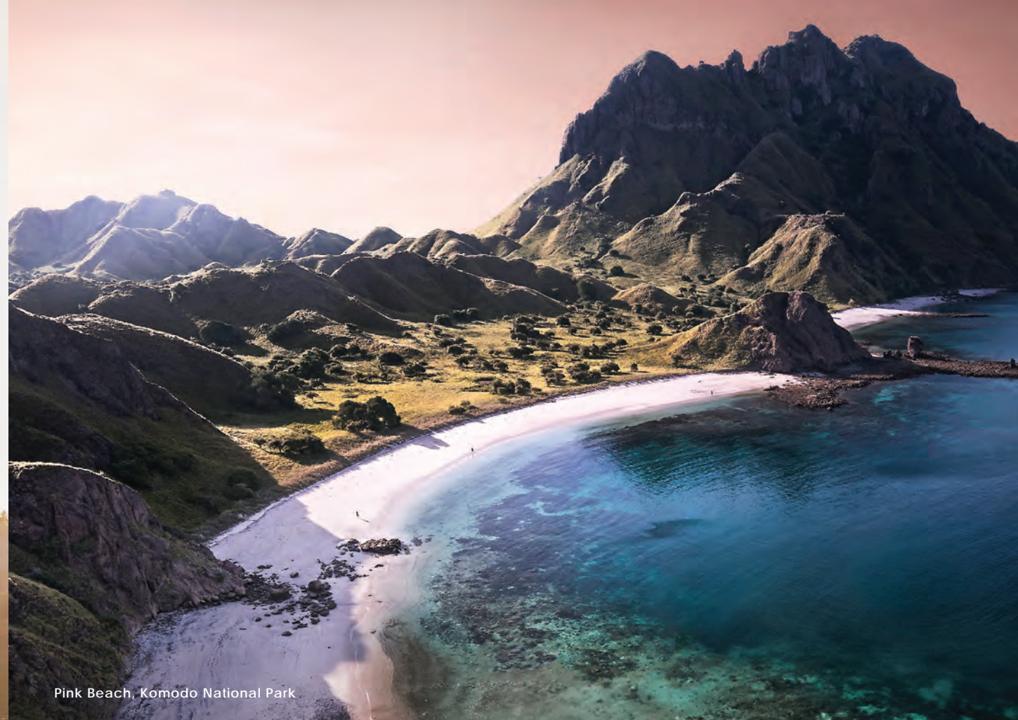
Pink Beach, Komodo National Park