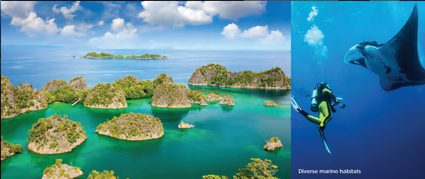
Diverse marine habitats

Discover paradise on the edge of the Pacific