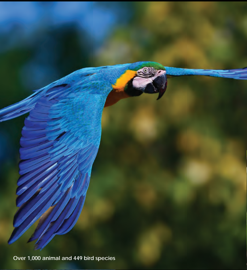
Over 1,000 animal and 449 bird species

OUR RIVER CRUISES GIVE YOU ACCESS TO THIS WILD PARADISE.