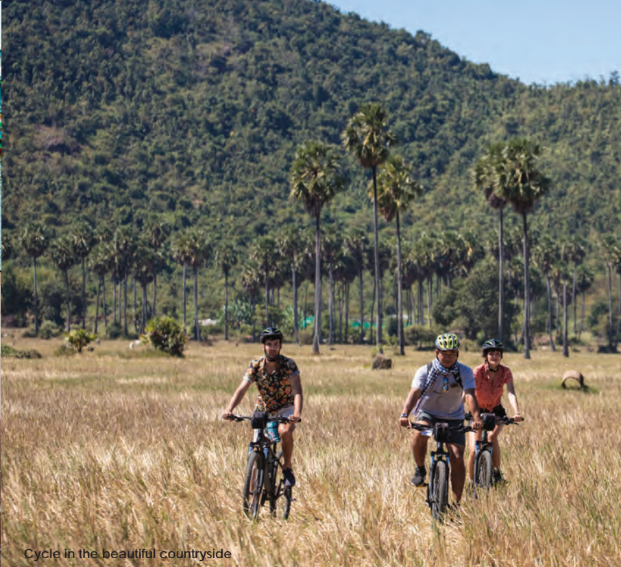
Cycle in the beautiful countryside