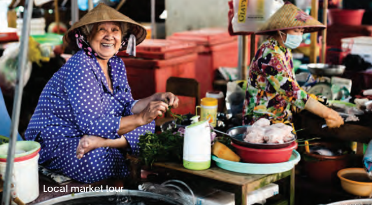
Local market tour