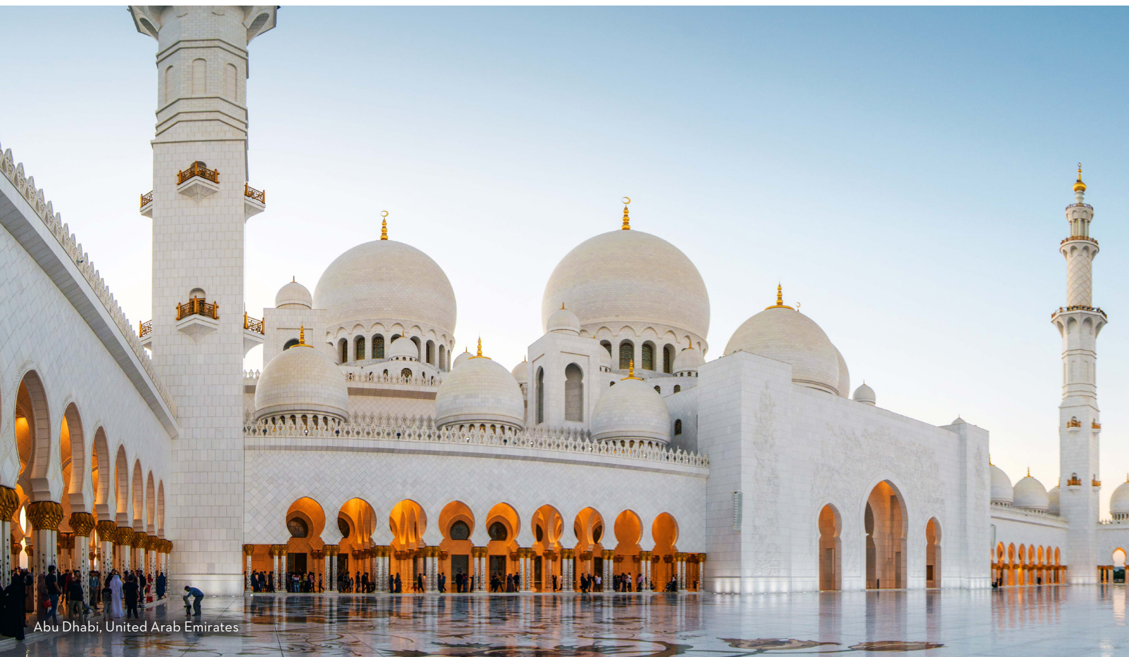
Abu Dhabi, United Arab Emirates