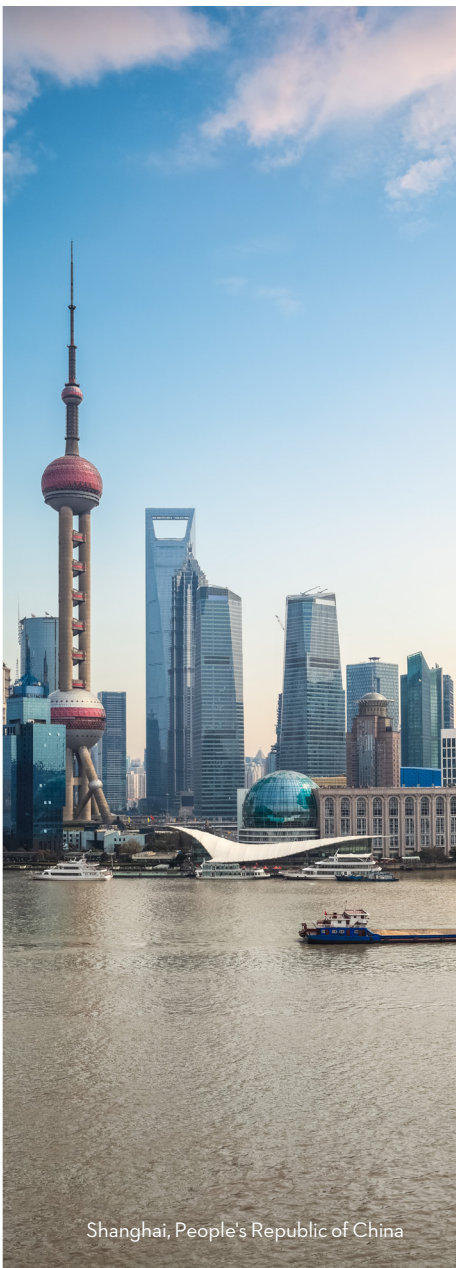
Shanghai, People's Republic of China