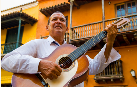
Guitarist playing local music