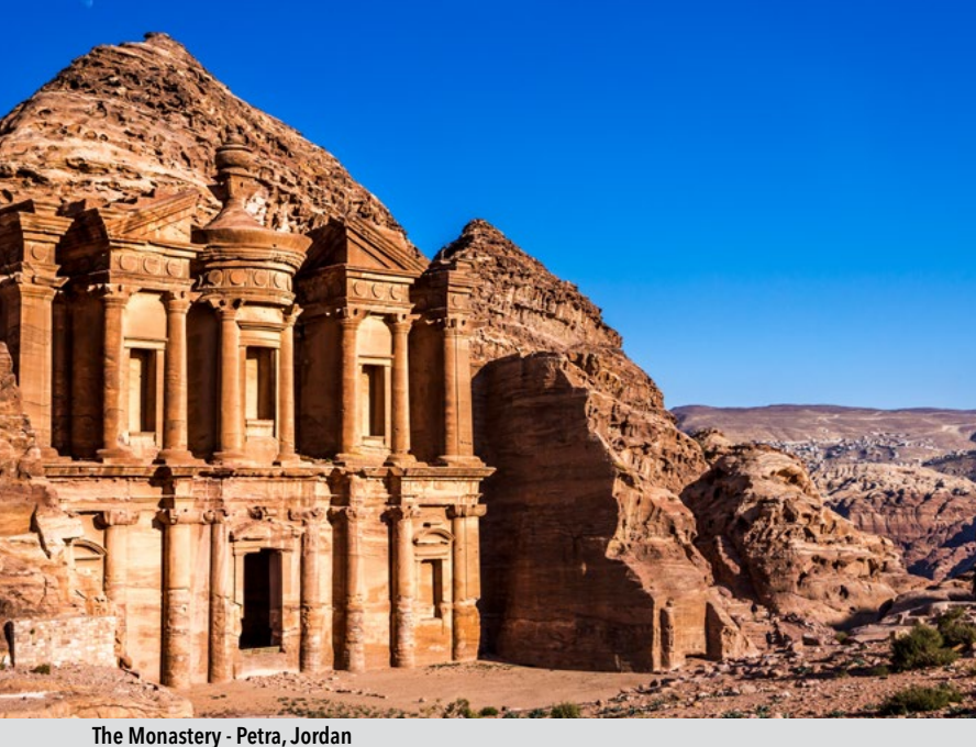
The Monastery - Petra, Jordan