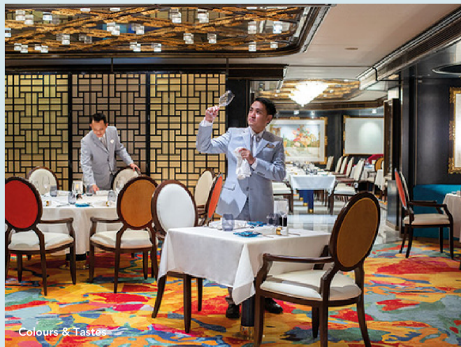
Colours & Tastes